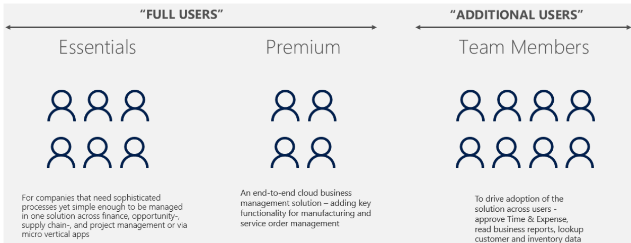
Figure 3: User Types